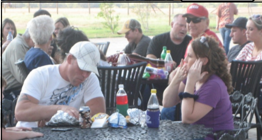
This young man really enjoyed the pulled pork sandwiches!